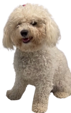
BEFORE Cristal Clean