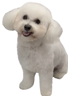
AFTER Cristal Clean